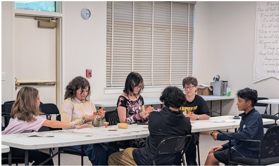
Youth Nights: Youth playing a game of Throw Throw Burrito!